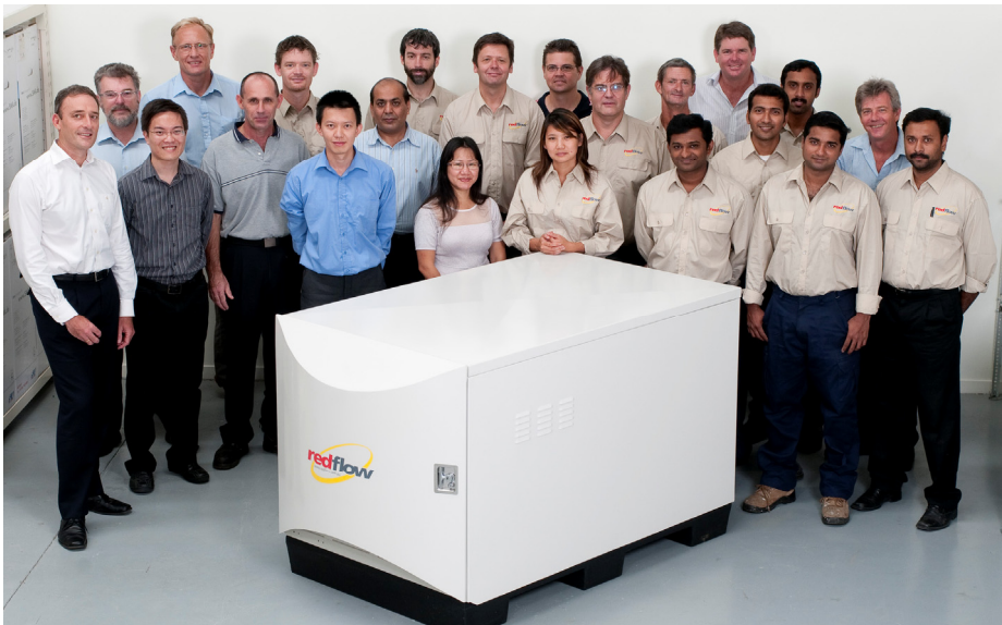
The RedFlow team with a zinc-bromine battery powered Power+BOS® energy storage system, January 2010

Applications for the Smart Grid, Smart City project have to be submitted during January 2010. RedFlow has had discussions with several utilities who may be submitting bids.