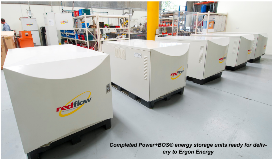
Completed Power+BOS® energy storage units ready for delivery to Ergon Energy