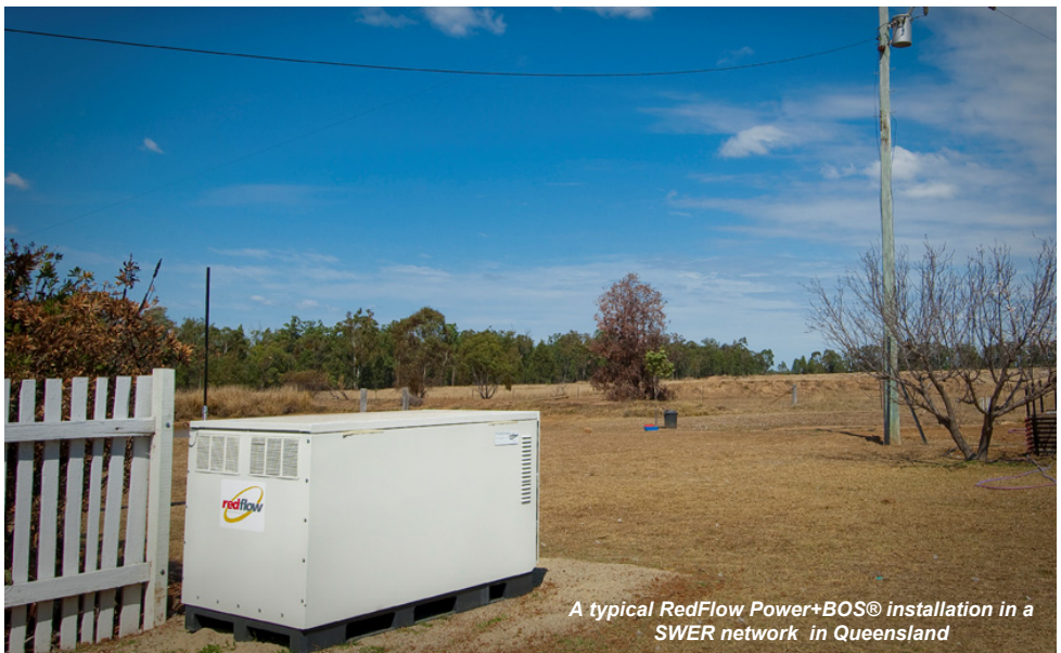
A typical RedFlow Power+BOS® installation in a SWER network in Queensland