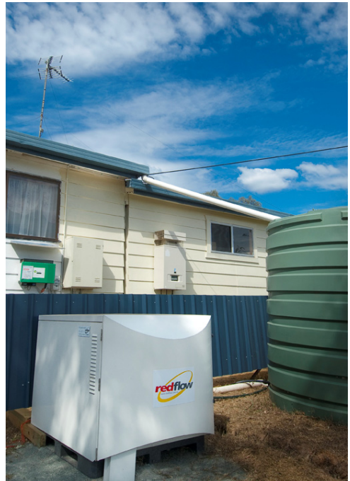
A RedFlow Power+BOS® energy storage system installed in Queensland