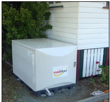
RedFlow ZnBr energy storage system installed in south-east Queensland

These systems have 20 kWh capacity in daily cycling.