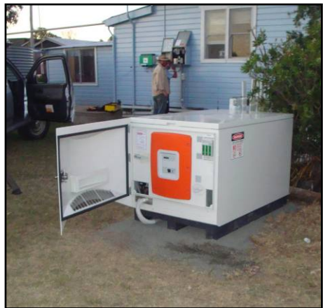
A RedFlow Power+BOS® zinc-bromine based battery system undergoing installation in May 2009.

RedFlow is now developing its plan for entering the much larger US market in 2010